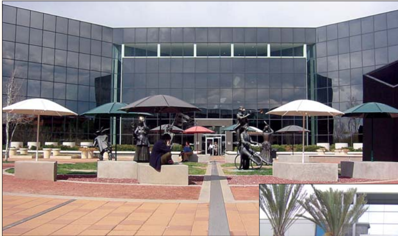
(from top to bottom) Digatron (Denver-headquartered credit union), Greater Alarm (San Diego Credit Union), Imperial Security Systems (Albany, N.Y., home) and Security Specialists (Greenwich, Conn., residence) received special honorary notice in Security Sales & Integration's 2004 Integrated Installation of the Year Awards.

They say people only remember who wins, but in the case of Security Sales and Integration's Best Integrated Commercial/Industrial and Residential Installations of the Year, the runner-ups are nearly as unforgettable.