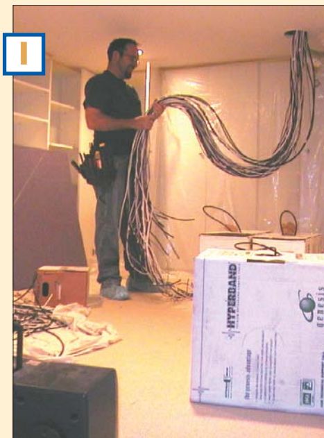
1. A Greater Alarm technician sorts through cables while preparing to retrofit an Elan rack system in the craft room, located upstairs within the home.