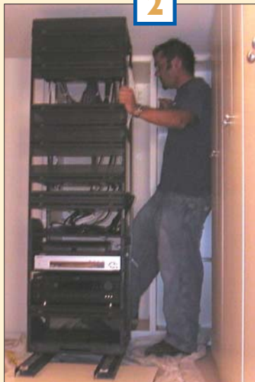
2. Next, the Elan rack system is installed inside the craft room's closet.