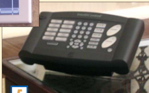
5. This is one of three Intellicontrol remote controls for TVs found in the family, game and teen rooms.

open to the various suggestions," details Fagundes. "He was very interested in cutting-edge technology, but also wanted it to be friendly to use."